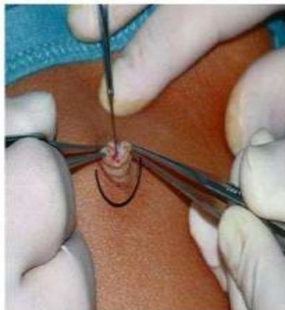
Verrese needle (classical technique) through infraumbilical incision