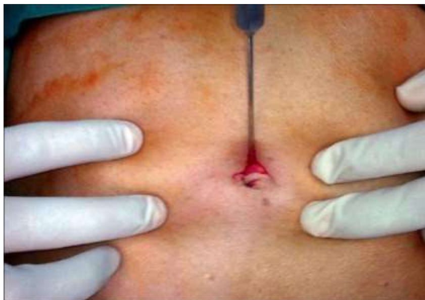
Transverse incision kept at superior border of umbilicus